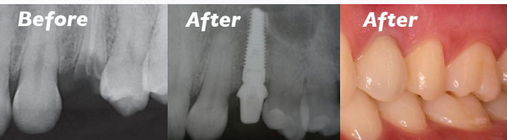
Initial X-ray Immediate Placement Final Restoration

This Interdisciplinary program is suited for both the General Dentist and the Specialist who wish to integrate dental implants into their practice. This program is geared more for the beginner or intermediate rather than the advanced dental implantology practitioner.